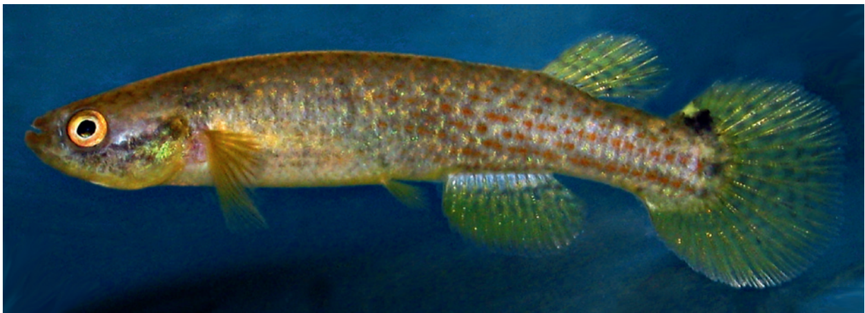
Fig. 2. Anablepsoides lineasoppilatae , female, MTD F 33003, female, 39.3 mm SL, Peru, Departamento Puno, Rio San Gaban drainage.

36–39. Cephalic neuromasts: supraorbital 3+3. Lateral line interrupted. Basihyal subtriangular. Second pharyngobranchial with one tooth. Vomerine teeth 2–3. Lateral process of post-temporal long. Single antero-dorsal process of urohyal.