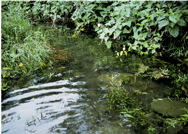
Fig. 4. Habitat (type locality) of Anablepsoides lineasoppilatae .

middle of the dorsal fin and by the absence (versus presence) of similar light yellow to orange zones on the dorsal and ventral margins of the caudal fin. However, our studies imply that the characteristics are taxonomically less usable because of its variable appearance (VALDESALICI & SCHINDLER, 2011).