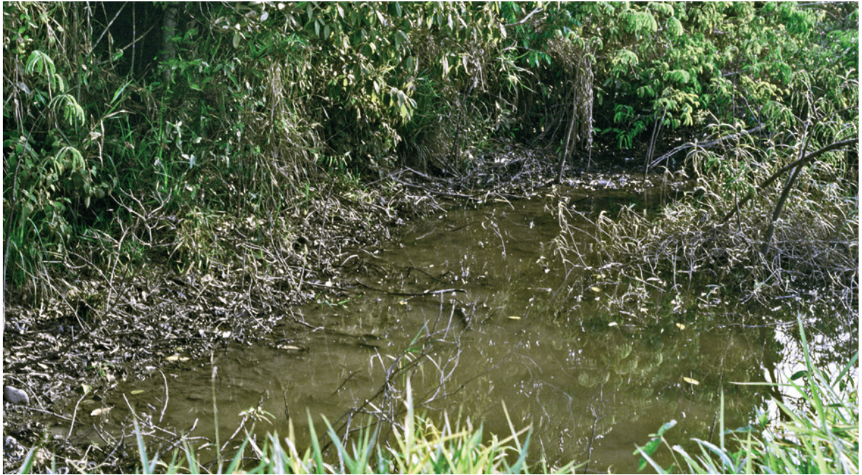
Fig. 7. Collecting site of Apistogramma sororcula sp. n. at the rio Guaporé in the vicinity of Vila Bela da Santíssima Trindade.