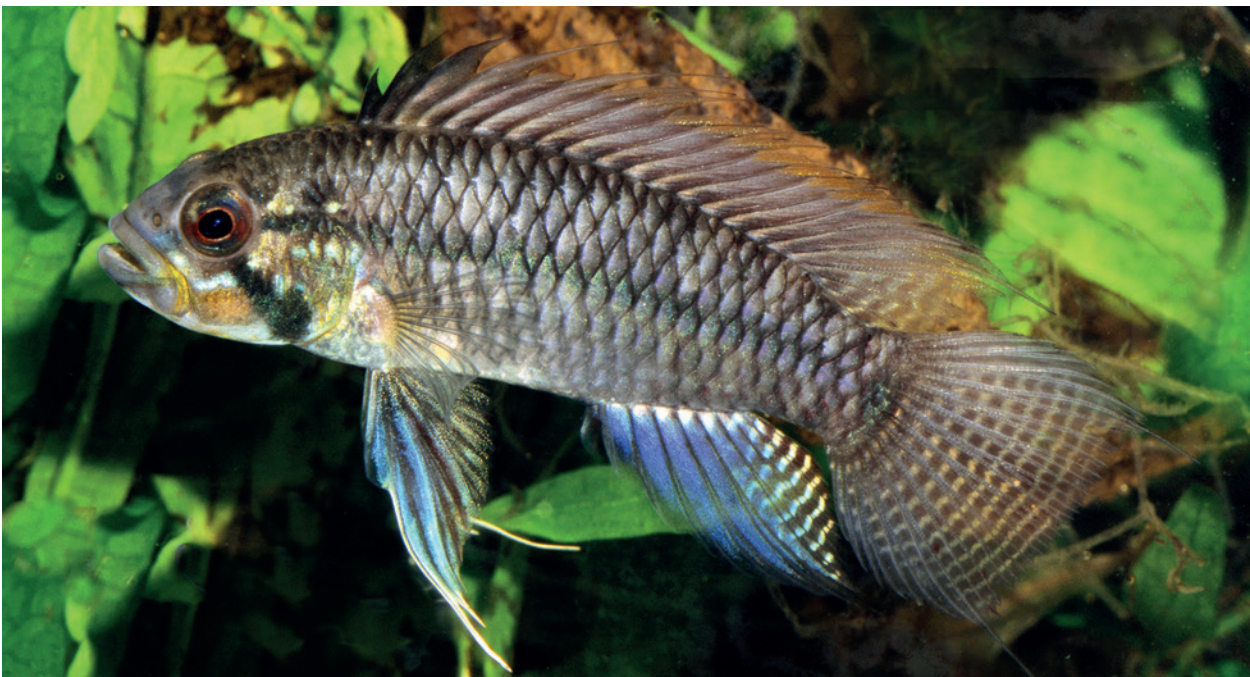
Fig. 3. Adult male of Apistogramma sororcula sp. n. (bluish colour morph) from type locality, photographed in the aquarium.

band. Black midventral stripe and vent region. Iris dark red.