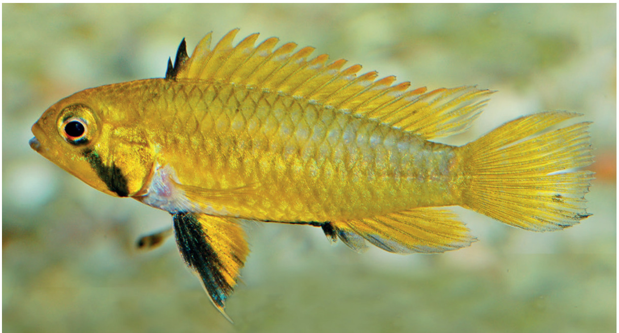
Fig. 5. Female of Apistogramma sororcula sp. n. from Rio San Martin during brood care in the aquarium.

fin and anal-fin membranes and anterior portion of ventral fins black. During brood care fins and body bright lemon yellow, usually without lateral band or lateral spot. Suborbital stripe often reduced to a black spot in the corner of the gill cover.