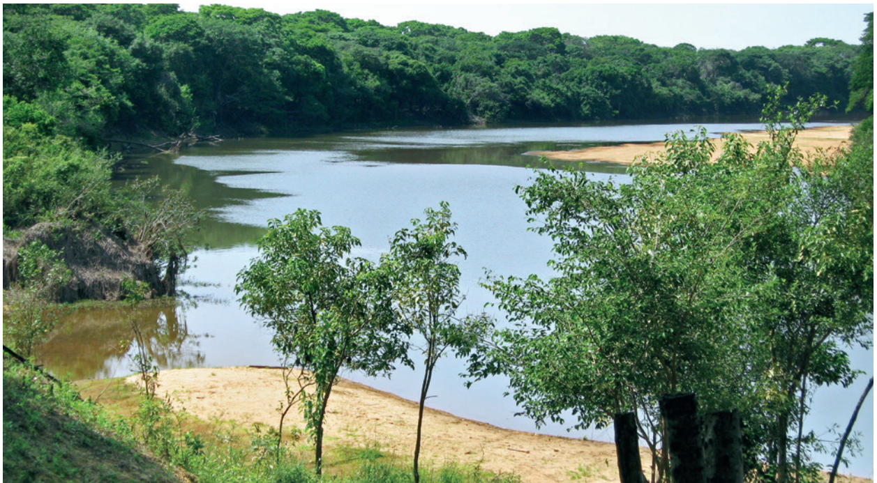
Fig. 8. Habitats of Apistogramma sororcula sp. n. at the rio San Martin (vicinity of Bella Vista).

sexual dimorphism and dichromatism. Adult males have a dark marking on the chin just below the lower lip, a lyrate caudal fin with dorsal and ventral streamers and a pattern of spot-stripes, a dorsal fin with two black anterior membranes and produced lappets, a lateral spot, a longitudinal band usually extending to the base of the caudal fin and abdominal markings in the anterior body region. Females possess a pectoral spot and a midventral stripe.