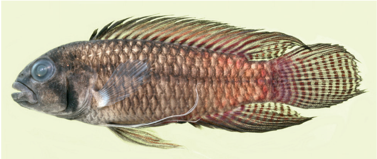
Fig. 1. Male Apistogramma sororcula sp. n., holotype, MTD-F 33580.