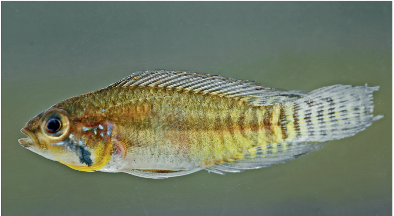
Fig. 4. Apistogramma staecki from the drainage of rio Manuripi in the vicinity of Puerto Rico (approx. 5 cm TL) in a photo tank immediately after capture.