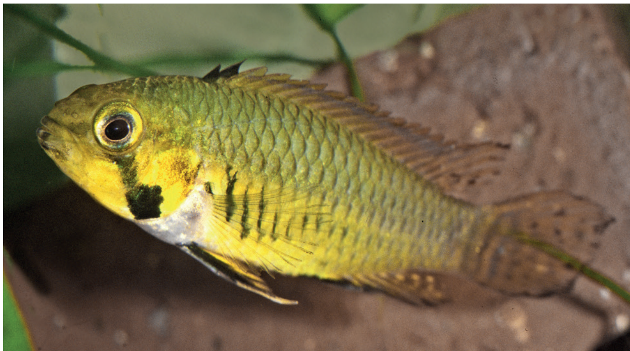
Fig. 6. Female paratype of Apistogramma sororcula sp. n. from Rio Guaporé with vertical streaks forming oblique abdominal stripes.

Vila Bela da Santíssima Trindade and in Bolivia in the drainage of the rio San Martín approx. 5 km upstream of the village Bella Vista. In addition, the species is also said to be exported for the aquarium hobby from the Lago das Cobras in the drainage of the rio Pacaás Novos in the southeast of the town Guajará-Mirim in the Estado Rondonia, Brazil (KOSLOWSKI, 2002).