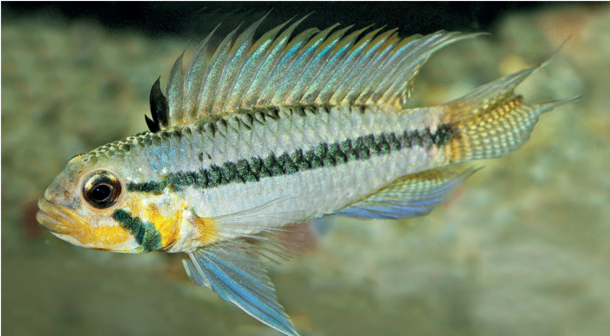
Fig. 2. Adult male of Apistogramma sororcula sp. n. (yellow colour morph) from type locality, photographed in the aquarium.